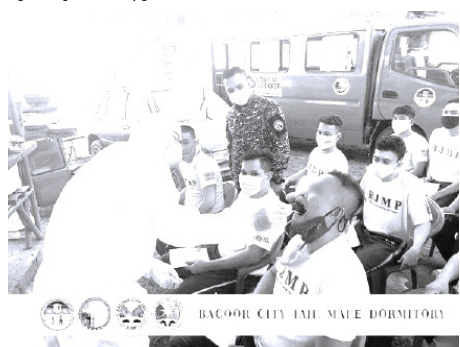
BACOOR CITY JAIL MALE DORMITORY

Nagsagawa ng monthly dental mission kamakailan ang Hospital and Jail Ministry sa Bacoor City Jail Male Dormitory. Sinabayan ito ng Online Bible Study kung saan lumahok ang mga Persons Deprived of Liberty. Sa huli'y pinamahagian ang ating PDLs ng food packs at hygiene kits.