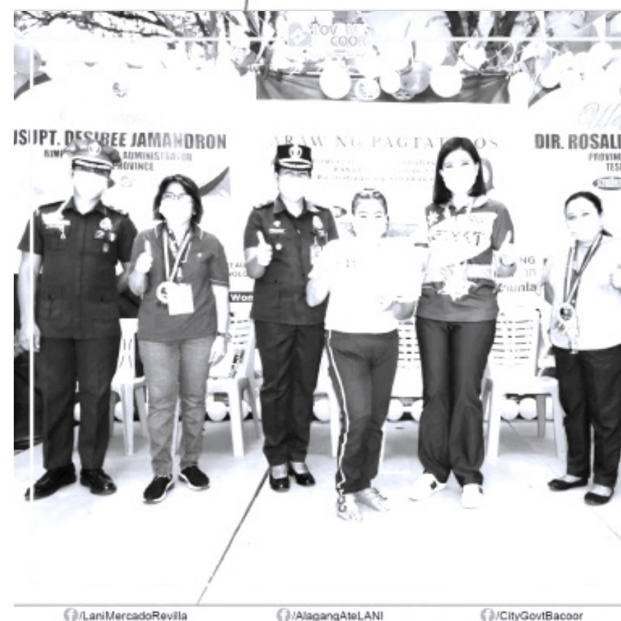
/LaniMercadoRevilla /AlagangAteLANI /CityGovtBacoor